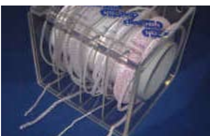
Flexistem Microclean Flexible cleaning of small bore items