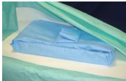
Super Soft Soaker Sheets High rapid absorption, built in strength