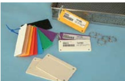
Tray Tags Identification and Traceability