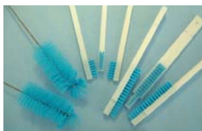
Blue Brushes Cleaning brush for instruments