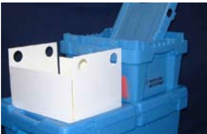
Transportation Boxes Sturdy Transportation

Clinipak Ltd is a medical manufacturing and distribution company. The product focus is Central Sterile Supplies and Theatre Sterile Supplies and the product range covers almost all items required within this area: for packing, protection, instrument presentation, colour coding and labelling, sterilisation control and cleaning and safe 'used instrument' circulation.