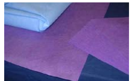
Purple Transportation Cover Bags Optimum Protection and Autoclavable