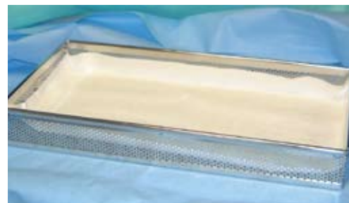
May be used as a heavy duty tray liner inside a tray.

The sheets can be used as a heavy duty tray liner inside a tray or more commonly used under a tray to protect sterilisation wraps from internal damage while still maintaining their condensate absorbing qualities. The sheets may also be used as bath mats or for drying instruments or trays after sterilisation.