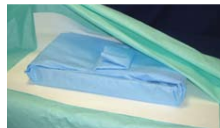
Often used between layers to facilitate dry packs.