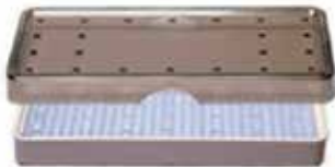
LSB1-3600 Minitainer, 3x6 Base, Lid and Mat DIM Internal 148 x 64 x 18 MM