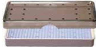
LSB1-3700 Minitainer, 3x7 Base, Lid and Mat DIM Internal 180 x 73 x 18.5 MM