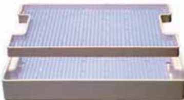
LSB1-7110 Minitainer, 7 x 11 Single Level Base, Lid and Deep Mat