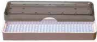
LSB1-2700 Minitainer, 2 x 7 Base, Lid and Mat DIM Internal 181 x 49 x 18.5 MM