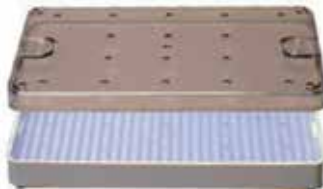
LSB1-4800 Minitainer, 4 x 8 Base, Lid and Mat DIM Internal 190 x 102 x 19 MM