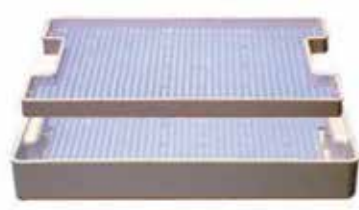
LSB1-7100 Minitainer, 7 x 11 Single Level Base, Lid and Shallow Mat