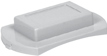
Removable lens cover supplied