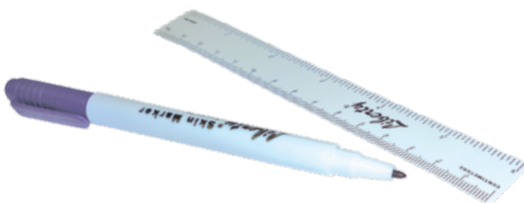
SMPARMT Regular is a Medium Tip (with a purple lid)