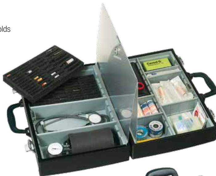
Contents Not Included