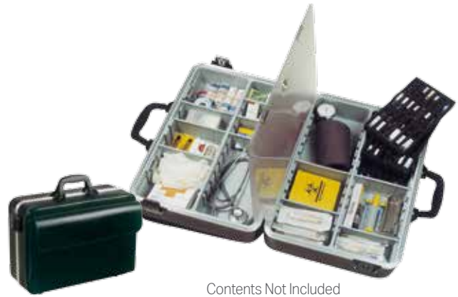
Contents Not Included

NOVA LEATHER BLACK NOVA LEATHER BROWN NOVA LEATHER BURGUNDY NOVA LEATHERETTE BLACK NOVA LEATHERETTE BROWN NOVA LEATHERETTE BURGUNDY