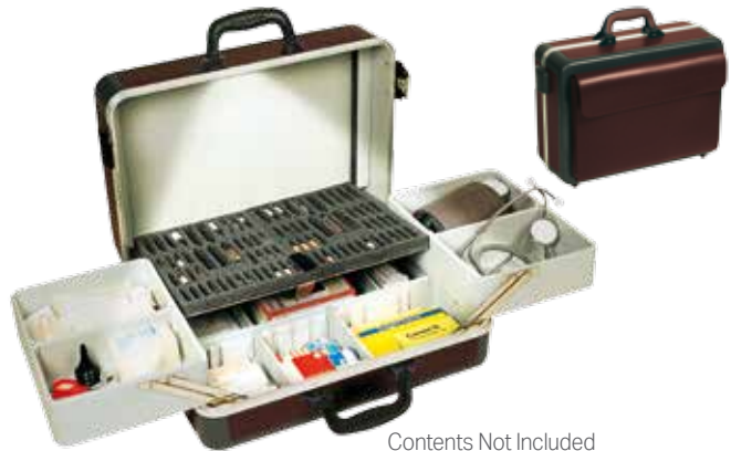
Contents Not Included

PROGRESS LEATHER BLACK PROGRESS LEATHER BROWN PROGRESS LEATHER BURGUNDY