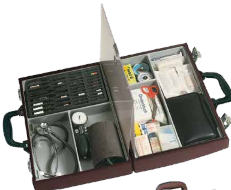
Contents Not Included